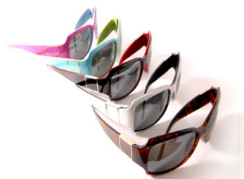
Sunglasses from Clerevision.

Australia, Dante and beautiful bracelets galore from Girls&Pearls and jewel city. Introducing