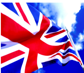
Flying the flag