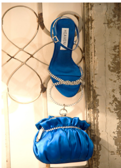
Perfect party combo from heavenly shoes