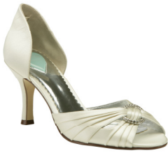
India from Belle... The perfect little pick me up!

MICHELIN STAR DINNER...NOW THAT WOULD BE NICE!